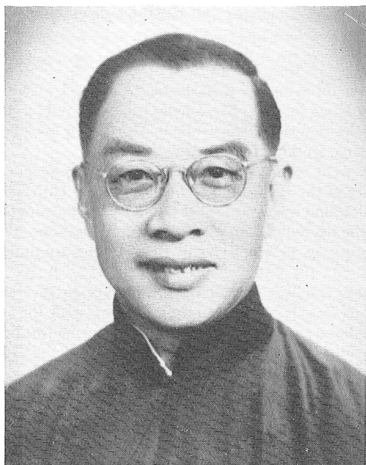
Dr. Ch'ien Mu

Dr. Ch'ien Mu was born in Wusih, Kiangsu, China, in 1895. After his graduation from a secondary school in Wuchin at the age of 17, he taught primary and middle schools in Wusih and Soochow for 18 years to help supporting his family during which he devoted himself to the study of Chinese literature and philosophy.