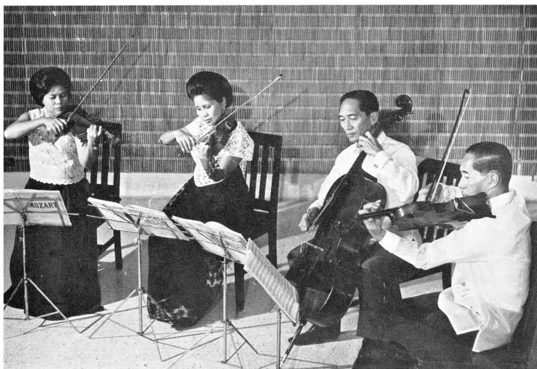
菲律賓大學弦樂四重奏樂團 The University of the Philippines String Quartet in Residence