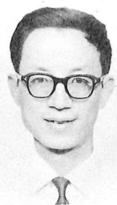
士博先述劉 Dr. Liu Shu-hsien

造，一九五八年獲文學碩士學位。一九五九至一九六四年，受聘於東海大學，歷任講師、副教授之職。一九六四年赴美國南伊利諾大學繼續進修，一九六六年獲哲學博士學位，並留在該校擔任助理教授及副教授。一九七一年應聘任新亞書院哲學講師。