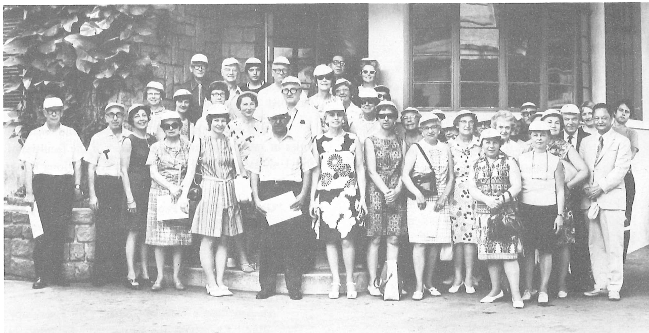
The International Seminar Group at South Sea Textile Mill