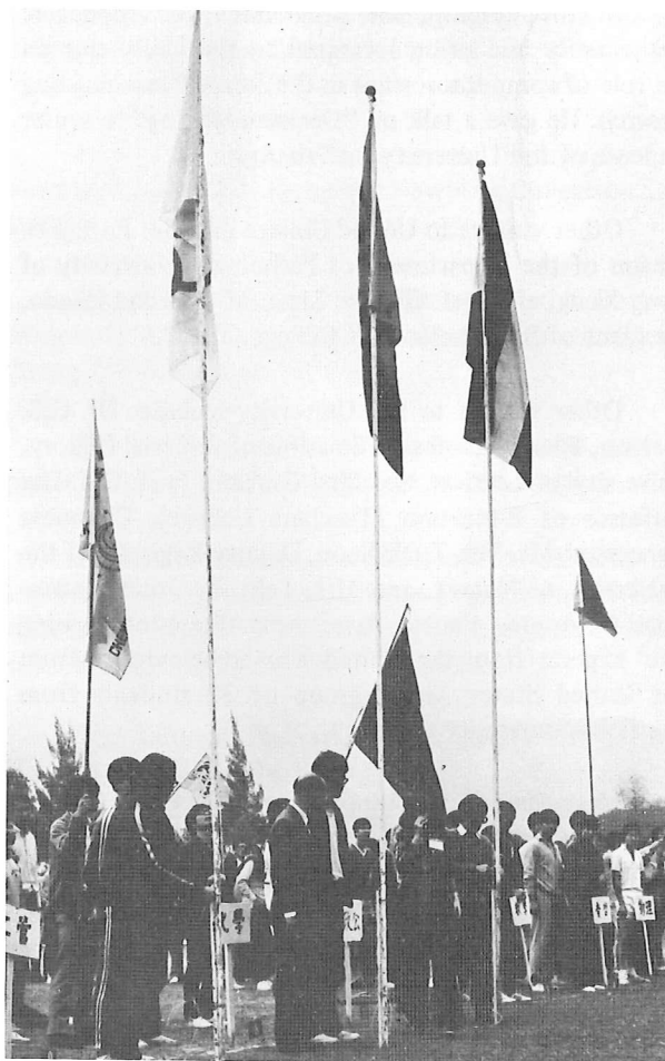
幕開會運陸屆三第 ▶ Opening of the Third Athletic Meet

The University Bulletin of The Chinese University of Hong Kong is published and distributed free by the University Bulletin Editorial Board among the University faculty and staff. Copies are also sent to friends of the University.