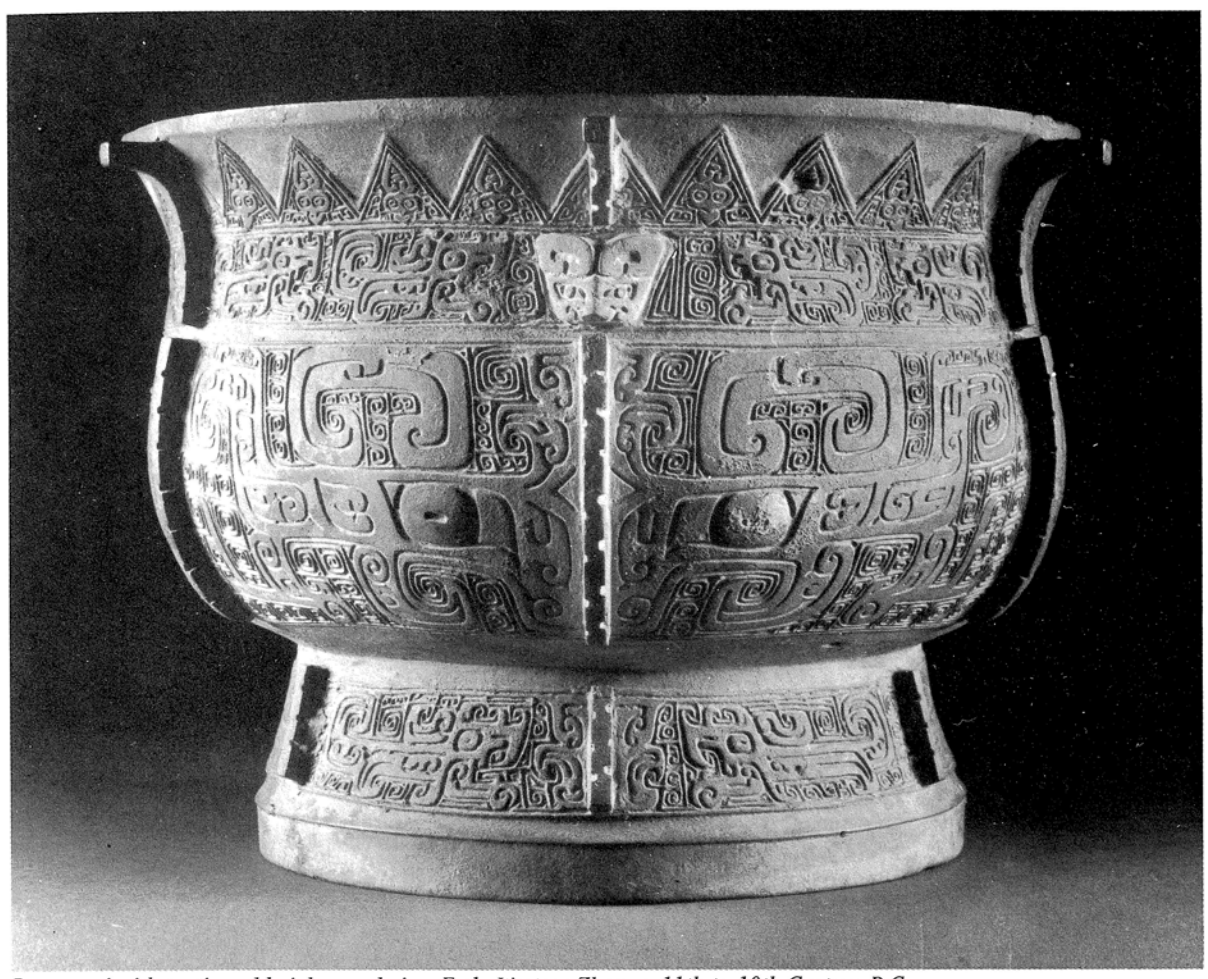
Bronze gui with taotie and kui-dragon design; Early Western Zhou, c. 11th to 10th Century B.C. Lent by Bei Shan Tang (Exhibition of Ancient Chinese Bronzes)