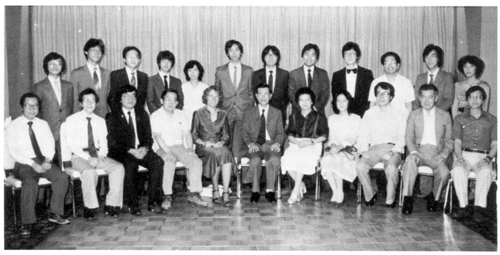
Staff and students of the Department of General Business Management and Personnel Management