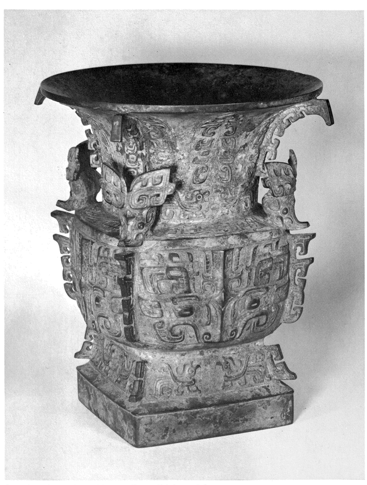
Bronze jun with taotie design; Mid-Western Zhou, c. 10th Century B.C. Lent by Bei Shan Tang (Exhibition of Ancient Chinese Bronzes)