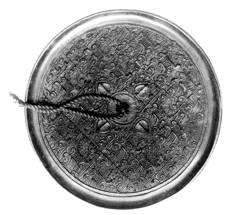
Bronze mirror with leaf petals on a ground of spirals; Warring States, 3rd Century B.C. Lent by S.Y. Kwan (Exhibition of Ancient Chinese Bronzes)