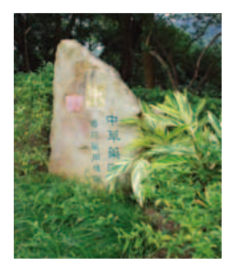
The 800 m² HERBSnSENSES Chinese Medicinal Garden is the home for over 20 flowering and fragrant herbs planted for teaching and research purposes.