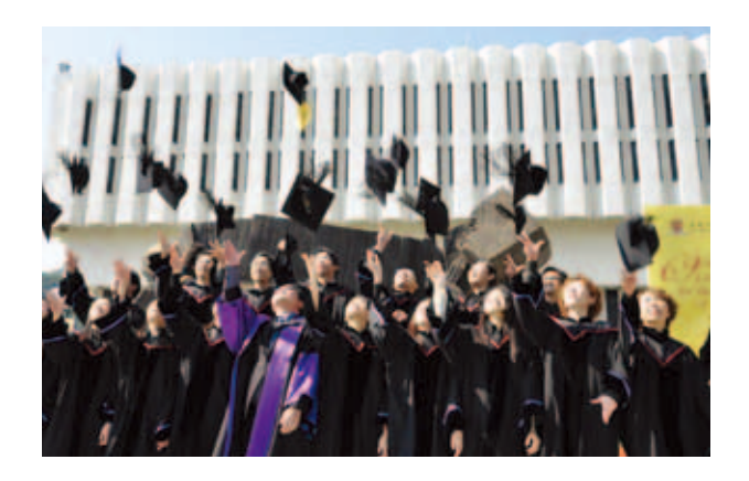
Major Career Fields of 2010 First Degree Holders*