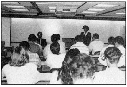
aspects of business and management practices in Hong Kong and Southeast

Entitled 'Asia-Pacific Challenge (Hong Kong and China)', the programme aimed at enhancing the participants' understanding of various