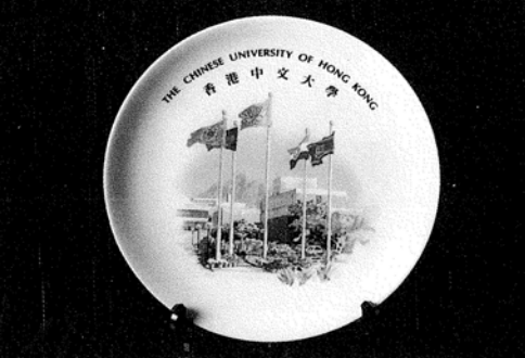
Porcelain plate with decorations featuring the Central Steps and the five flagpoles; HK$80

20 20 30 20 20 20 30 30 20 20 20 30 30 30 20 20 30 30 30 30 20 30 30 30