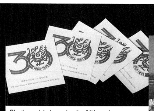
Plastic car label carrying the 30th anniversary logo (4" x 4.5"; purple); HK$3