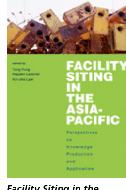
Facility Siting in the Asia-Pacific

現有研究設施選址的文獻多源於歐美經驗,這本文集所載的亞太經驗有利於比較研究。此外,大部分現有文獻均假設社區和發展者之間的矛盾才值得注視,又假定選址的問題在建造階段前便會結束。文集不但挑戰這兩個假設,更強調毗鄰地區在選址爭議中的重要性,以及必須考慮在建造後階段出現的矛盾和衝突。對於全球各地的政策制定者、環境學家和學者,這些都是非常寶貴和實用的資料。