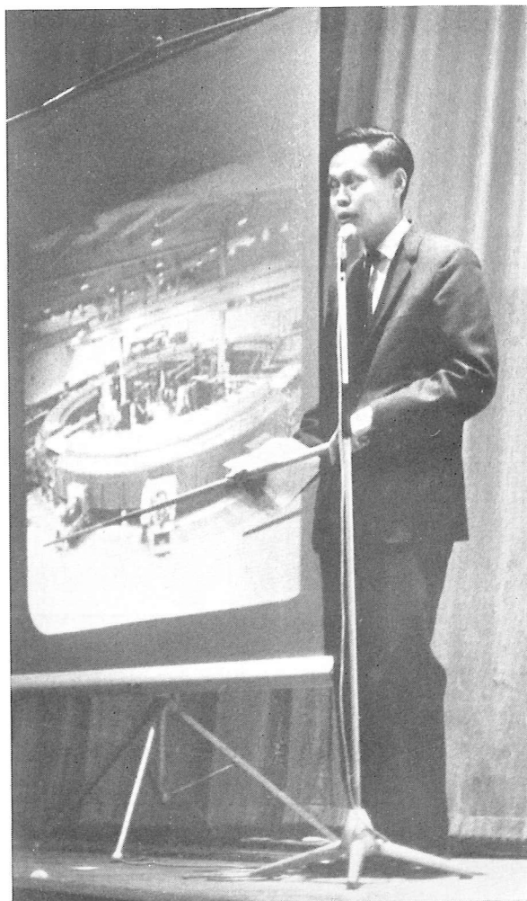
Dr. Yang Chen-Ning at City Hall lecture.

On Wednesday afternoon, December 30, 1964, at the invitation of the Chinese University, he gave a public lecture on "What is Modern High Energy Physics" in the Concert Hall of the City Hall. The Hall, with its seating accommodation for 1400, was packed to capacity long before the start of the lecture. Thousands had to be turned away. It was an occasion that will long be remembered here in Hong Kong and cherished in the hearts of all Chinese.