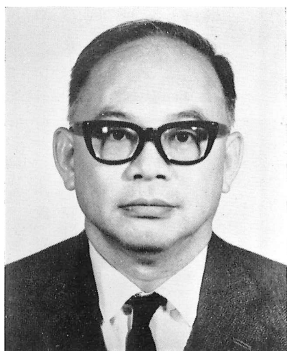
師 牧 華 紹 潘