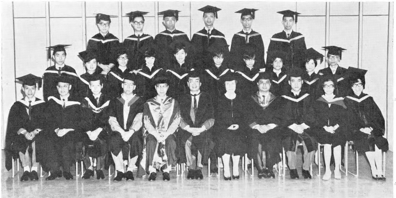
影合生師體全屆三第院學育教 Staff and Graduates of the School of Education, 1967-68.