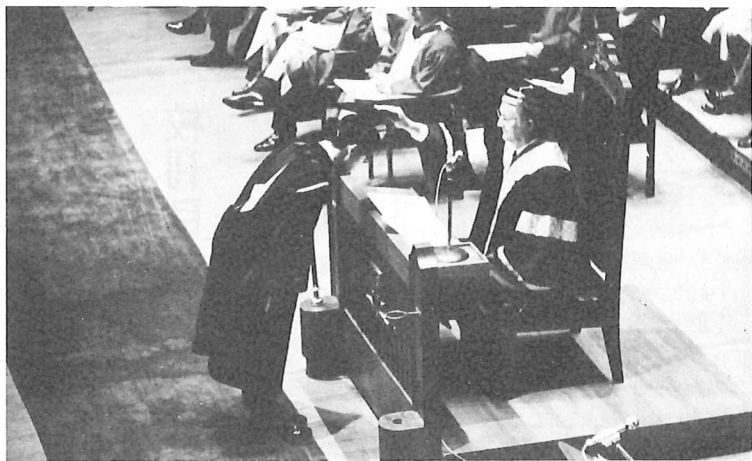
大學監督麥浩士爵士主持頒授學位典禮 His Excellency the Chancellor "capping" a graduate

在學生方面，中大學生會雖然只不過成立了一年多，可是和各學院的學生會合作得非常融洽。中大學生會非但主編了中大學生報，又有了自己的會歌，而且還主持了今年中大的新生輔導會，發揮了中文大學的精神。