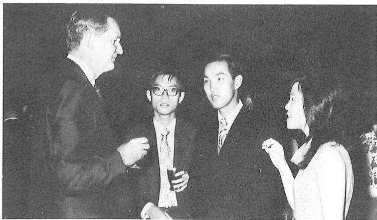
大學監督麥理浩爵士在宴會中與畢業生談話 H.E. the Chancellor Sir Murray MacLehose talking to the new graduates at the graduation dinner

此外，對昨日領受榮譽博士學位的兩位先生，我所要說的是：本校能與您兩位知名人士關係更爲密切，實在是本校的光榮，並且今晚在座的青年，和本校以前及將來各屆的畢業同學，都