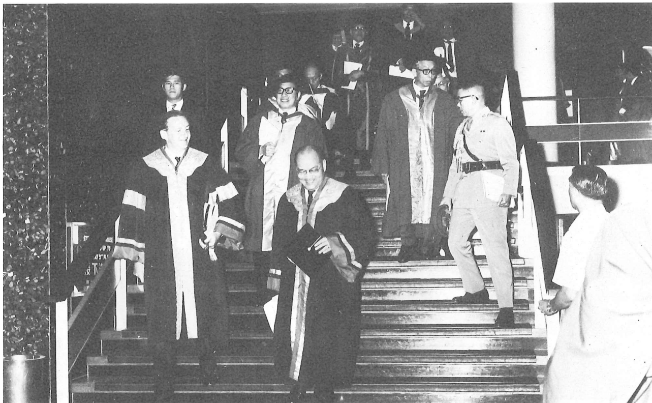
堂禮開離人禮主後畢完禮典 The procession leaving the Hall after the Congregation

So much for academic developments. On the administrative side, The Chinese University has also followed a policy of pooling resources. The outstanding innovation here is the computerization of the Staff Payroll System, the Space Utilization System, the University Health Service System, and the Personnel Records System. At the same time steps have been taken toward systematizing and recording by computer the entire transcript of student records and the inter-collegiate timetable. Accounting procedures have been standardized, and operations are being streamlined. Such matters as University purchases, intra-campus transportation and campus security have been handled centrally.