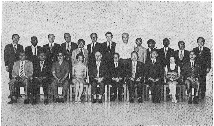
出席會議之東南亞及太平洋區聯邦大學行政人員 Participants of the Third Commonwealth Conference of Registrars

發展高等教育，以配合國家的需要。這地區的大學，在結構上一向都以西方主要國家的大學為典型，現在有許多大學仍然是如此。但不管大學的結構如何，各國都力求大學教育配合國家的需要；因此要保持大學在國際上的水準，大學必須有重大的革新。大學校務主任舉行會議，最注重的自然是各國大學所面臨的行政上的困難。當然各國都有共同的困難，這些困難都能加以分門別類，正如我們過去一週內所討論的題目一樣，但解決這些問題的方法卻因個別國家的情況而不