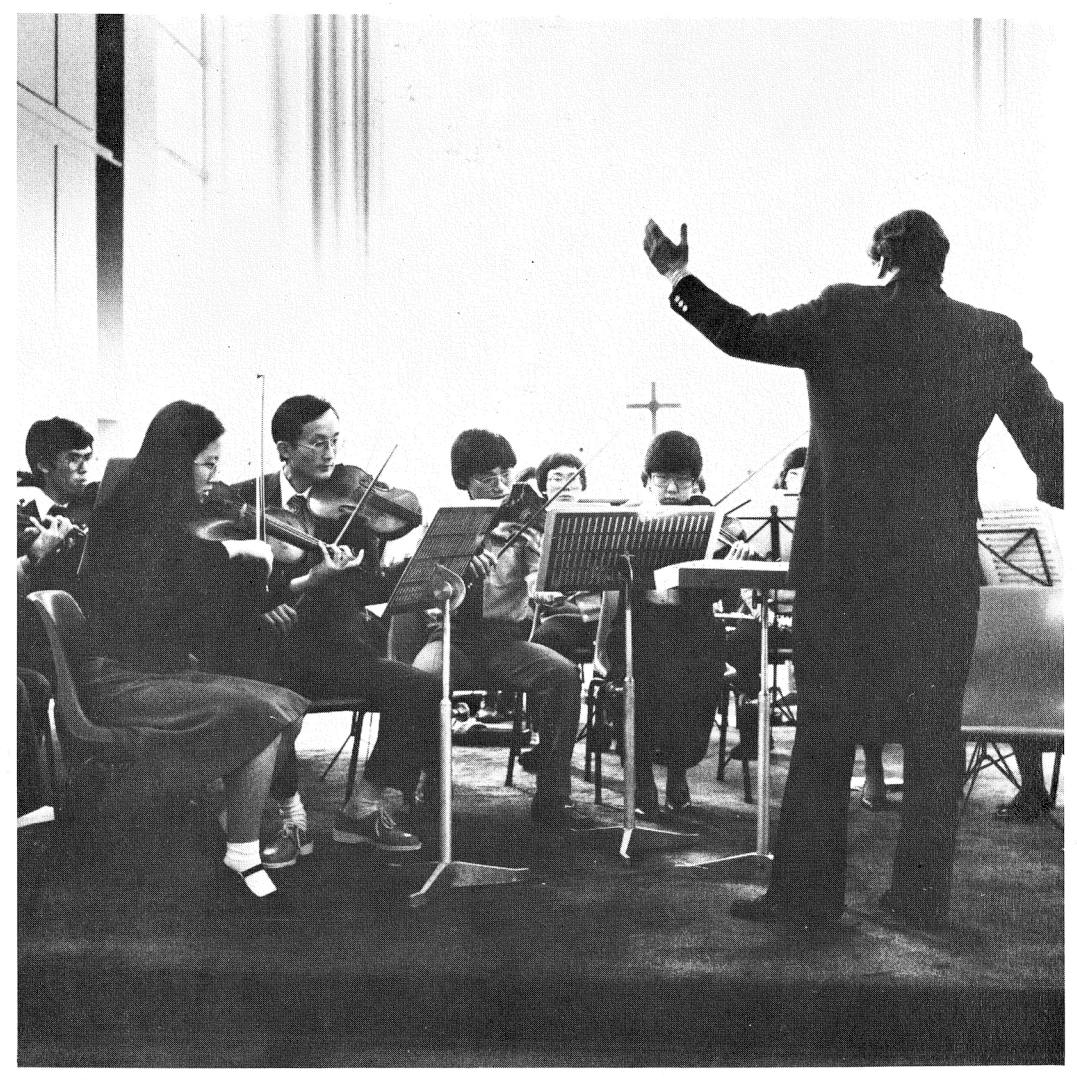
The Chinese University Orchestra performing at the Chung Chi College Assembly.