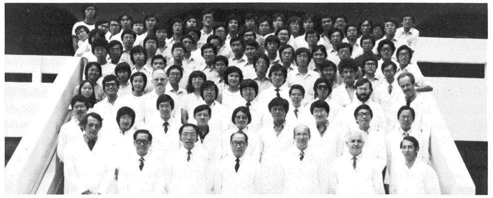
The first class of medical students taken with teachers of the Faculty in 1981

Finally, on behalf of my classmates, I wish to take this opportunity to thank all our teachers and staff of the medical Faculty for their guidance and solicitude, and for paving the way for our development during these five years.