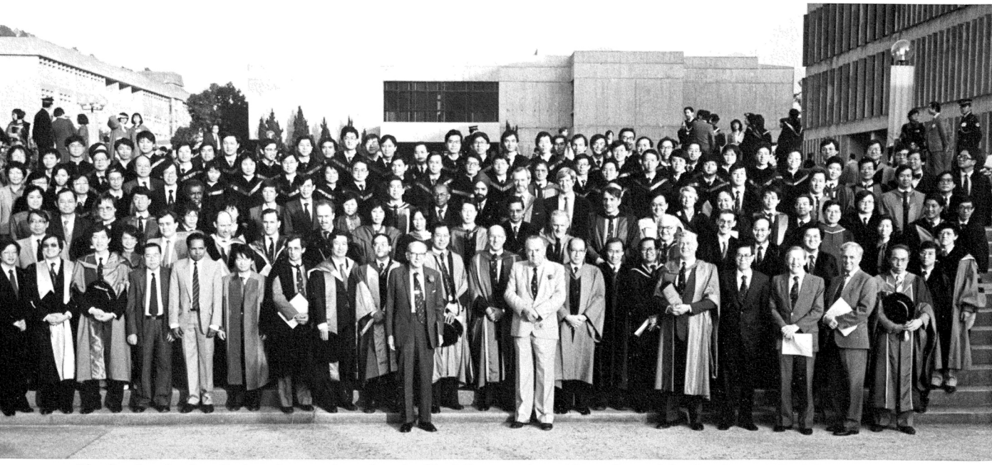
The first batch of medical graduates taken after the 32nd Congregation with teachers of the Faculty and MAAC members