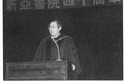
New Asia College

then organized at the college staff club and chapel lounge. The college produced 427 graduates this year.