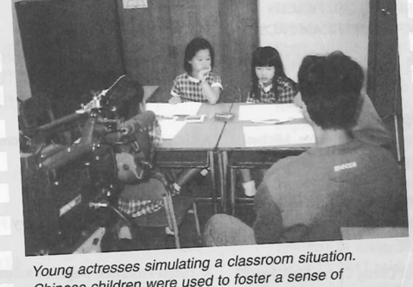
Chinese children were used to foster a sense of identification

Shooting on location at the Tai Po Old Market Public students from inter-