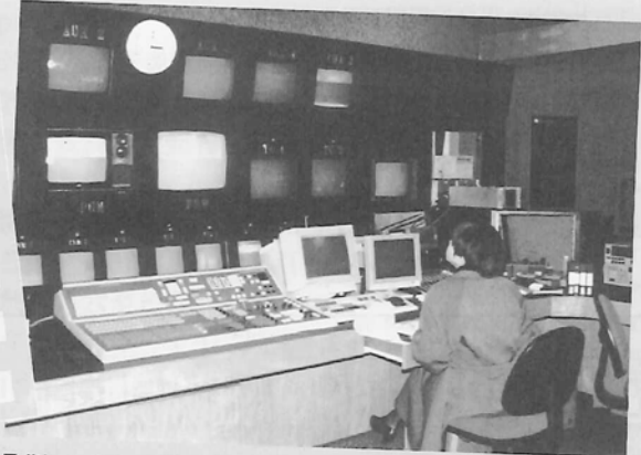
Editing of the videos takes place in the Press's Audio-Visual Division

lessons, such as what is referred to as 'teacher talk' -