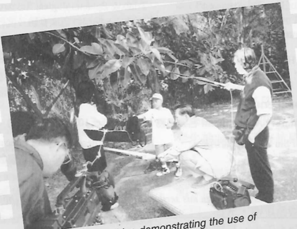
A scene from the video demonstrating the use of English outside the classroom