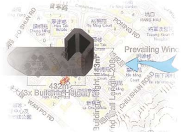
通風和屏風樓導向研究計算的將軍澳東港城附近的風影區 The wind shadow area near East Point, Tseung Kwan O, as calculated by the study of urban ventilation and wall effects of buildings

Two projects by Master's students of the Department of Architecture won respectively the first prize and an honourable mention in the graduate category of the Hong Kong Institute of Architects Sustainable Design Student Project Award 2007 last December for their concern for the environment and people.