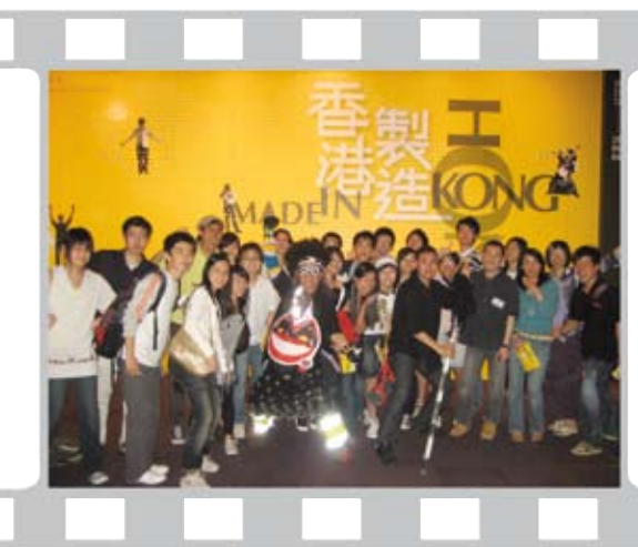
參觀本地展覽 Visiting Local Exhibitions