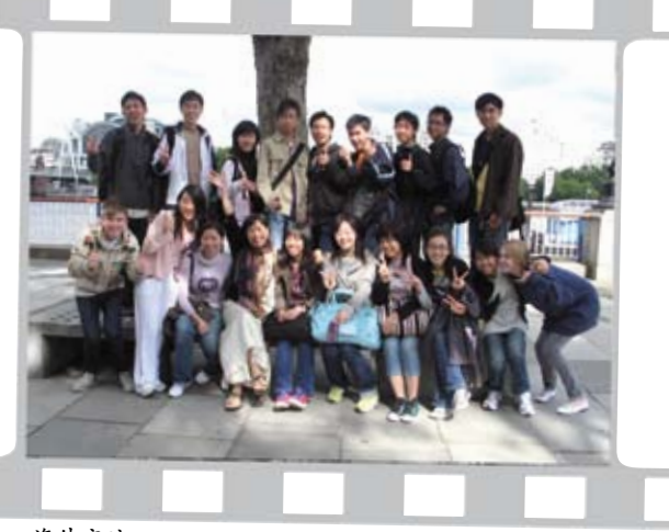
海外交流 An Overseas Trip

The programme admits 30 students each year and expects applications from first-year undergraduate students who are keen on developing their leadership potential.