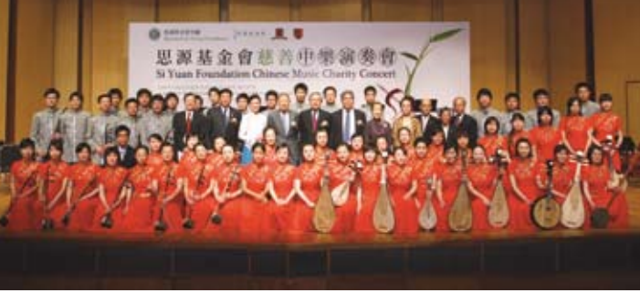
思源基金會慈善中樂演奏會為中大醫學院籌得近一百萬元 The Si Yuan Foundation Chinese Music Charity Concert raised close to HK$1 million for the Faculty of Medicine