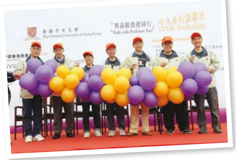
(左起) 劉遵義校長、馬臨教授、高錕教授伉儷、鄭海泉博士、金耀 基教授,以及劉世鏞先生主持開步禮

Alumni, staff, students and friends of CUHK, along