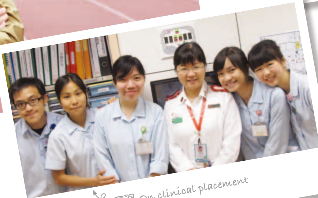
實習 On clinical placement

村上春樹在《關於跑步，我說的其實是……》中說，希望自己的墓誌銘可以刻着：「作家（也是跑者），至少到最後都沒有用走的。」