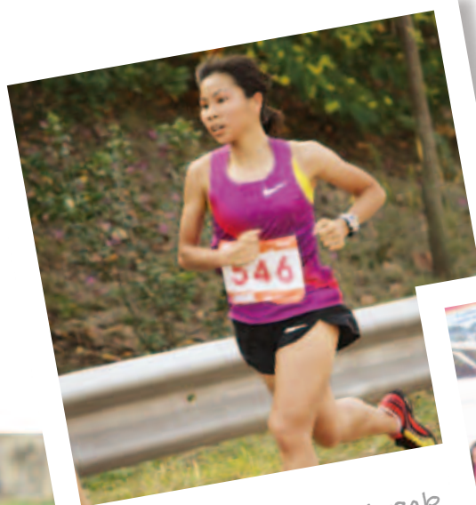
比賽 On the track