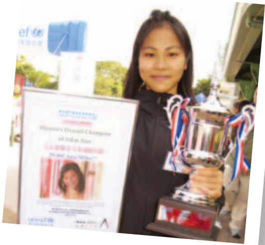
奪冠 The champion

In his book What I talk about When I talk about Running , Murakami Haruki proposes as his epitaph, 'Writer (and Runner). At least he never walked.'