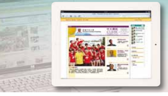
《中大通訊》電子版 Online version of CUHK Newsletter