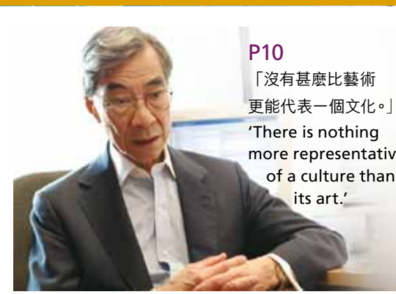
更能代表一個文化。」 more representative of a culture than