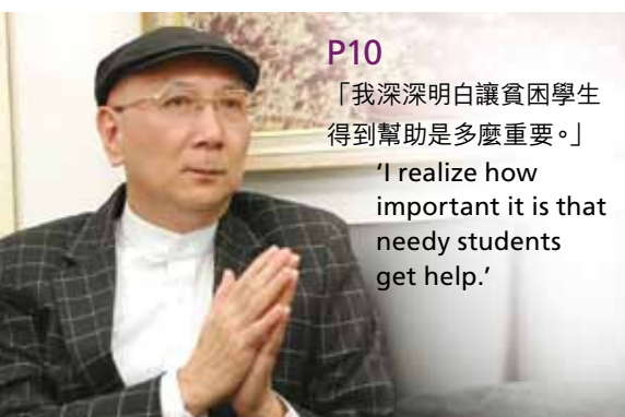
《中大通訊》電子版 Online version of CUHK Newsletter