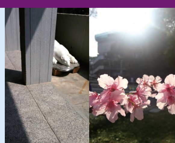
臉書專頁 Facebook Page: www.facebook.com/cuhkcivility

In line with hiking day, 'A picture is worth a thousand words' Campaign was organized. CUHK members were invited to take snapshots of the campus which impressed them the most and upload them to Facebook. Here are some of them. For more, please visit the Lecture on Civility Facebook Page.