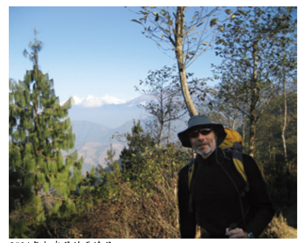
2014年初在尼泊爾遠足 On a hiking trip to Nepal in early 2014

language. It was at that time that I began to take up the study of Chinese seriously, so much so that when I first started to work in Hong Kong as an academic, I was able to conduct some lectures in Putonghua. I thoroughly enjoy my present work in Hong Kong, which comprises teaching, research and services, and have found my working knowledge of Chinese a great help and an advantage.