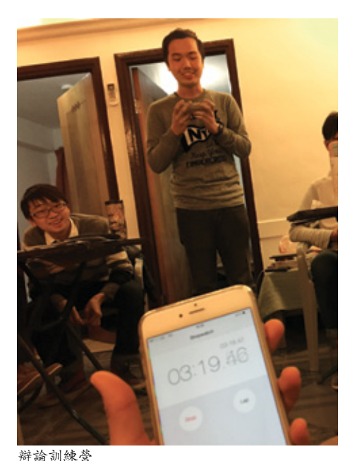
Capturing the championship for the ninth time in the Inter-varsity Debate Competition