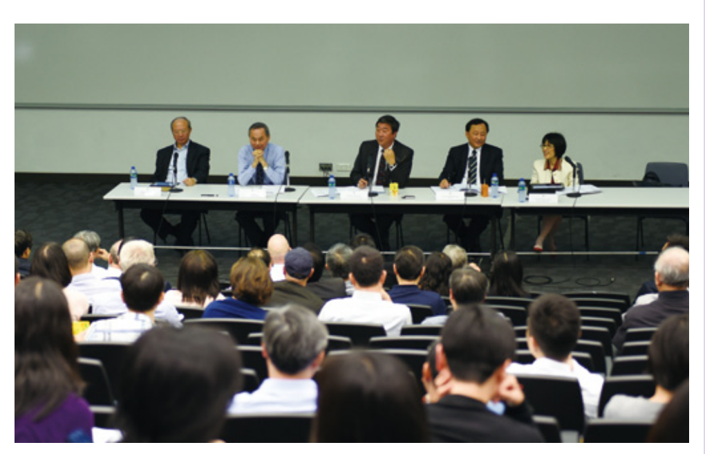
views. Those who cannot attend are welcome to give feedback online.

It is anticipated that a draft will be completed at the end of 2015, with a view to have a finalized plan in early 2016 for endorsement by the Senate and approval by the Council before a public launch.