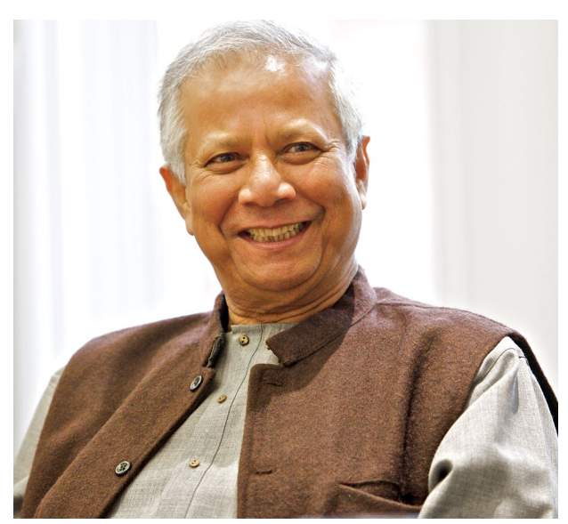
穆罕默德·尤努斯教授 Prof. Muhammad Yunus

The government's recent figures on poverty in Hong Kong indicate close to a million people are struggling under the poverty line, which means one out of every seven Hong Kongers live in poverty. Is poverty impossible to eliminate? Or have we been using the wrong approach? On 14 October, Prof. Muhammad Yunus , Bengali economist, also known as 'Banker to the Poor', was invited to CUHK by the University Lecture on Civility to share his ideas on tackling poverty with a thousand-strong audience on the topic 'Small Loans for a Big Future'.