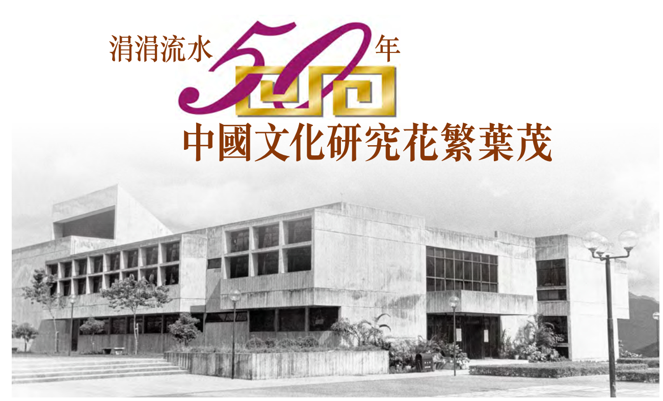
中國文化研究所落成外貌 Institute of Chinese Studies upon completion

國文化研究所一樓的澄軒,布置以酸枝桌椅,書架擺滿該所出版的學報、論文和專書,滲出的濃濃中國氣息,與研究所實在是再匹配不過了。「這裏正是我四十多年前碩士論文答辯的房間!」所長 梁元生 教授笑説:「我的整個碩士修業期,都是在此上課,培養了我對研究所一份特別的感情。」今年是中國文化研究所成立五十周年,由梁教授來談舊說新,亦是不二人選。