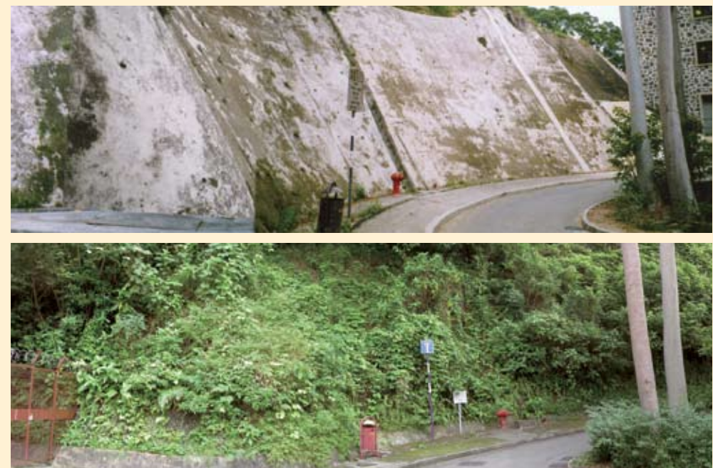
九十年代在崇基職員宿舍附近蓋滿灰泥護面的斜坡(上圖);同一斜坡的現貌(下圖)。 Before: a slope covered with chunam plaster near Chung Chi staff quarters in the 1990s (top) After: the same slope now (above)

A more time-consuming method of stabilization—trench excavation—was used to stabilize this fillslope near the Lady Shaw Building so tree removal can be minimized. Part of the procedure was carried