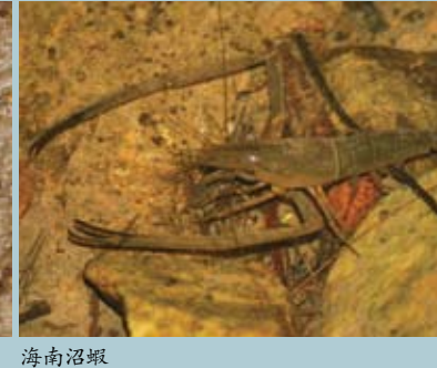
Hainan Swamp Shrimp (Macrobrachium hainanense)