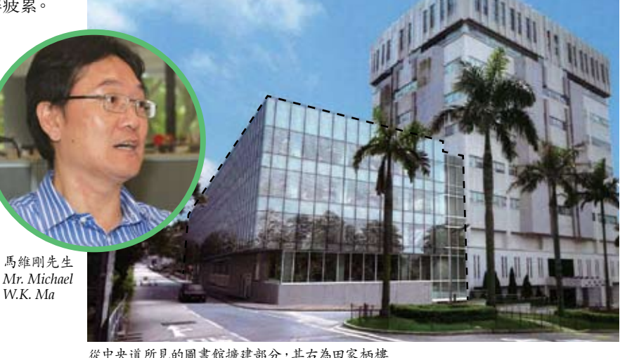
從中央道所見的圖書館擴建部分,其右為田家柄樓 Simulation of library extension from Central Avenue with Tin Ka Ping Building on the right

兩座綜合教學大學(左)及第三座教學大樓(右)透視圖 Perspective of Two Integrated Teaching Buildings (left) and the Third Integrated Building (right)