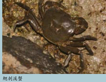
Common Freshwater Crab ( Cryptopotamon anacoluthon )