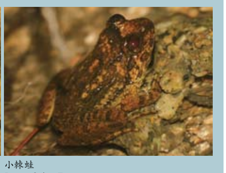
Lesser Spiny Frog (Paa exilispinose)