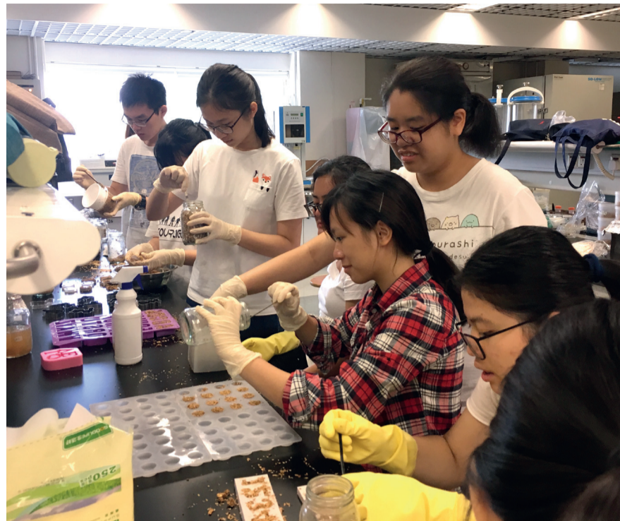
▲ 學員製作菇菌種植包 Learning to make mushroom growing packs