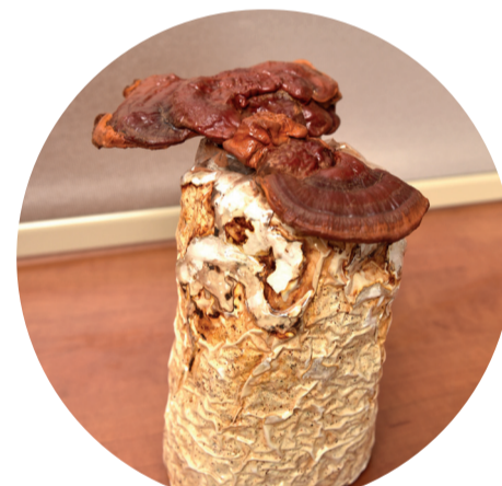
▲ 菇菌由菌絲長成，頂部為食用子實體，底部為用途廣泛的生物材料 Mushrooms grow from mycelium. The upper part is the fruiting body and the rest is used for producing biomaterials

成員在推動菇菌教育時培養出自信、團隊精神與溝通能力， 黎淑茵 認為這有賴關教授鼓勵她們參與各項創新創業比賽：由去年的「挑戰杯」全國賽香港區選拔賽、中大「校長杯」、南山「創業之星」大賽，直至逾十五萬隊學生參與的「創青春」全國大學生創業大賽，關教授和何穎芝一直為其商業提案、簡報設計、表達技巧等提供指導。憑藉豐富的社區實踐經驗和優秀的解說，參賽項目「菇創未來」最終獲得「創青春」公益創業賽金獎，也是香港代表隊唯一的金獎。