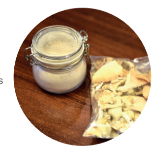
▶ 團隊現積極開發菇粉產品，照顧老齡人口所需 The team is developing mushroom powder products to accommodate the needs of the aged

2017年成立的Mushroom Social Project是社企的雛型，成員在校園推動菇菌教育，翌年幸得中大「可持續知識轉移項目基金」撥款四十萬元，成立社企Mushroom-X。該基金是首個本港由院校設立的社企種子基金，旨在支持中大成員把研究成果轉化為社會效益，以可持續的商業模式營運社企，惠澤社群。